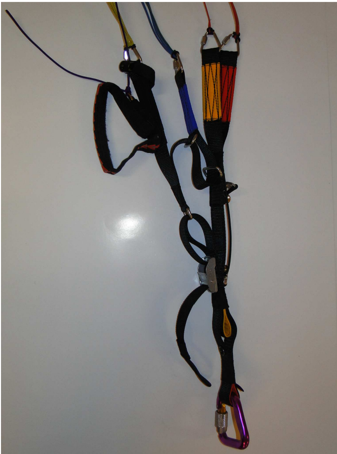
Fig 1: Golden4 multipurpose risers

The multipurpose risers are designed for pilots who use their Golden4 for both paramotor and freeflight flying. Using these risers means you don't need to fit different risers for different kinds of flights. If you haven't seen them before, there are two different hangpoints. The lower, red hangpoint is for both freeflight and paramotor use. To maintain EN / LTF B certification of your glider in free flight you must hook the trimmers into the main karabiner and use these hangpoints (see Fig 2).