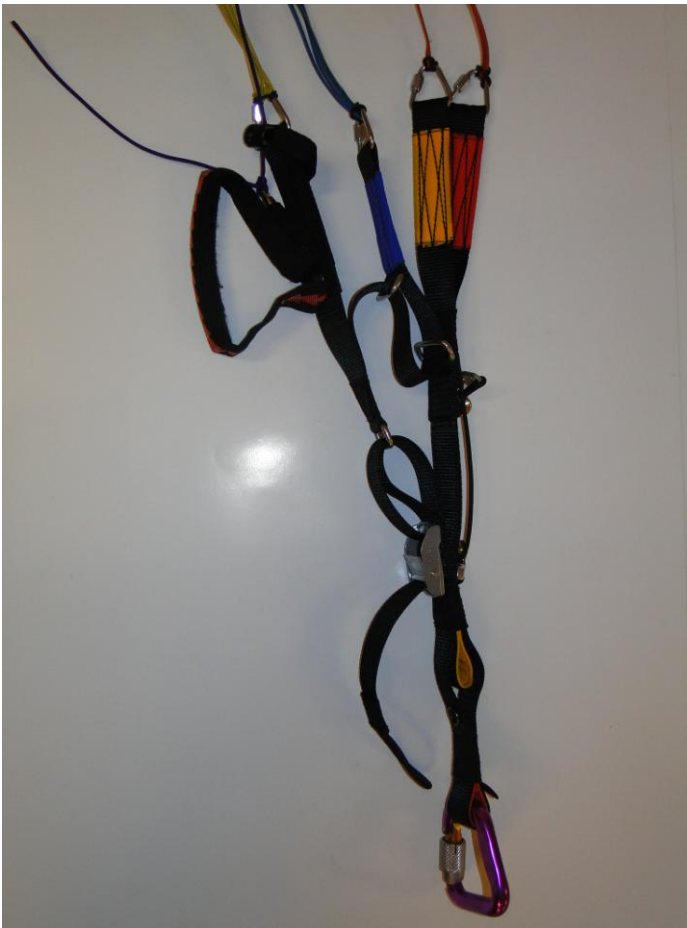
Fig 1: Golden3 multipurpose risers

The multipurpose risers are designed for pilots who use their Golden3 for both paramotor and freeflight flying. Using these risers means you don't need to fit different risers for different kinds of flights. If you haven't seen them before, there are two different hangpoints. The lower, red hangpoint is for both freeflight and paramotor use. To maintain EN / LTF B certification of your glider in free flight you must hook the trimmers into the main karabiner and use these hangpoints (see Fig 2).